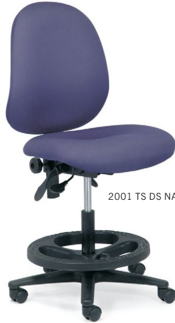
2001 TS DS NA

Base & casters 5-legged, reinforced molded fibreglass base.