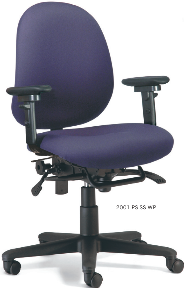
2001 PS SS WP