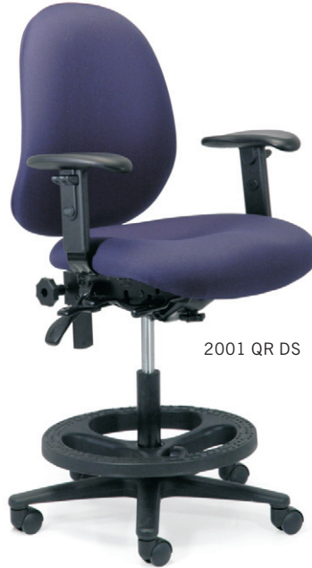
2001 QR DS

Base & casters 5-legged, reinforced molded fibreglass base with casters.