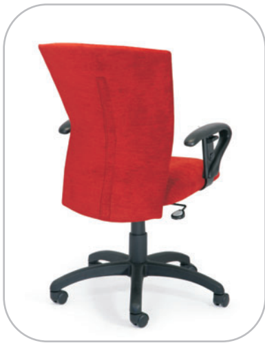
C-arm height adjustment