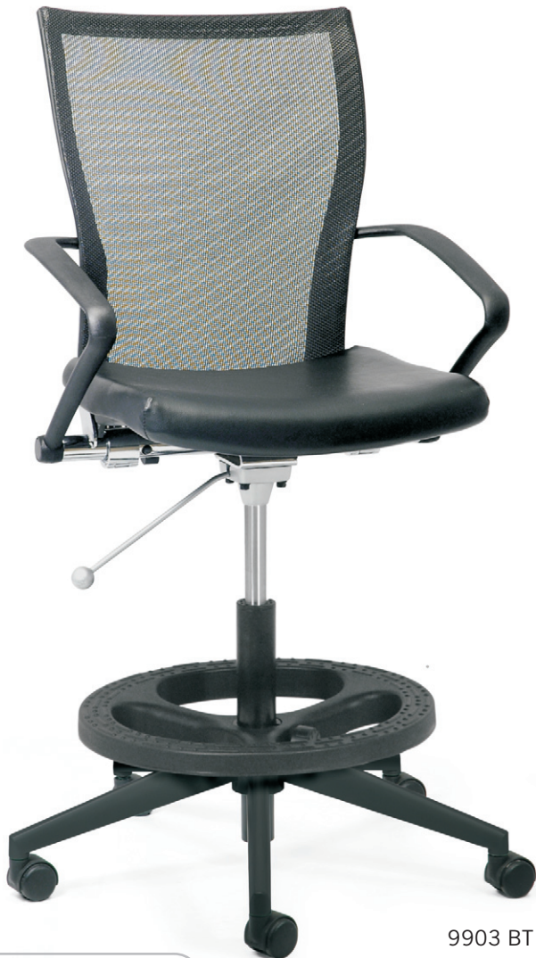
9903 BT DS

Base 5-legged metal base is finished with flat black powder coating.